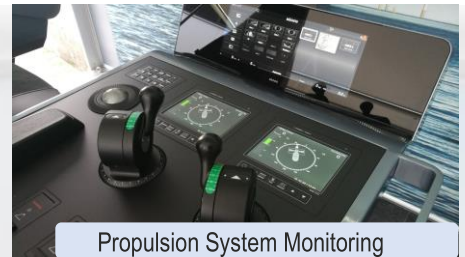
Propulsion System Monitoring

Furthermore, we are showing a new type of screen switching method with the option of displaying four systems simultaneously on one monitor (split screen).