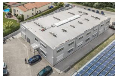
Development, Projecting and Sales