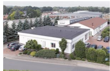
Purchase, Production and Warehouse