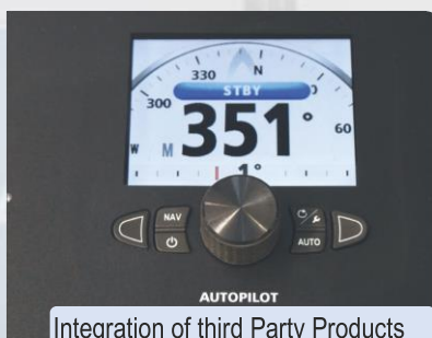
Integration of third Party Products