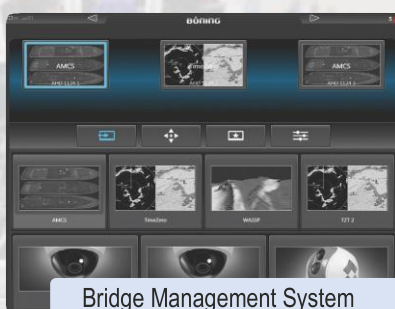
Bridge Management System