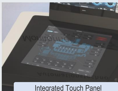
Integrated Touch Panel