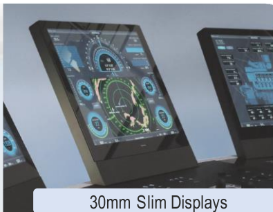
30mm Slim Displays