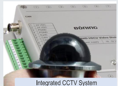
Integrated CCTV System

We have expanded our product range with new, compact marine cameras for connection to our proven AHD-VDCU video matrix. These deliver high image quality with significantly lower video image delay times.