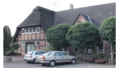
Training / Showroom